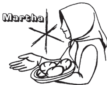
July 29th Saint Martha

Excerpts from the Lectionary for Mass ©2001, 1998, 1970 CCD